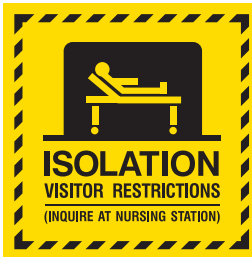
S2-02 Isolation: Visitor Restrictions EN