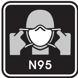
S4-01 Masks - N95 INT

Personal Protective Equipment (PPE) is a necessity in any infection control situation, from food handling to the operating table. Use these symbols to remind, identify and educate about these required precautions.