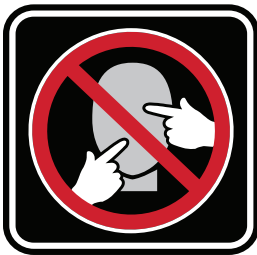
S5-04 Do Not Touch Your Face INT