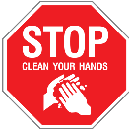
S1-01 Stop: Clean Your Hands EN

Hand hygiene is the most important intervention in preventing the spread of infection. However, it is often overlooked, so even health care professionals need reminders.