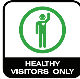
S5-02 Healthy Visitors Only EN