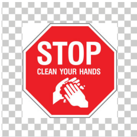
RGB JPEG (no transparency leads to white square around the image)