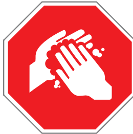
S1-02 Stop: Clean Your Hands (No Text) INT