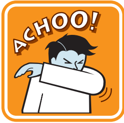
S5-01 Achoo! Sneeze in Sleeve EN

Public health organizations across the globe are an important voice in controlling the spread of infection by educating and encouraging the public on best practices.