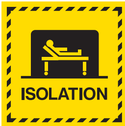
S2-01 Isolation EN

Isolation is a practice that needs to be followed to be effective. Ensure that even the public helps out. Use this symbol to get attention, and use supporting text to communicate specific restrictions. For specific precautions that involve wearing Personal Protective Equipment, use alongside Section 4 .