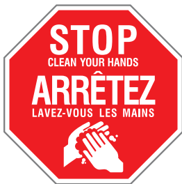
S1-04 Stop: Clean Your Hands Bilingual EN/FR