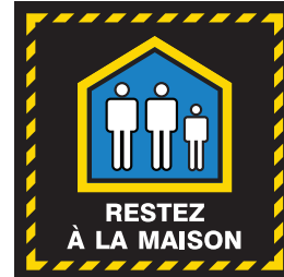
S5-09 Restez à la Maison FR