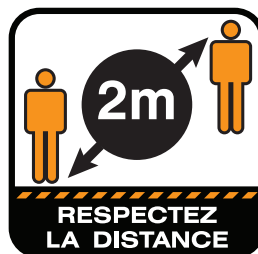
S5-08 Respectez la Distance FR