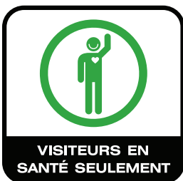
S5-07 Visiteurs en Santé Seulement FR