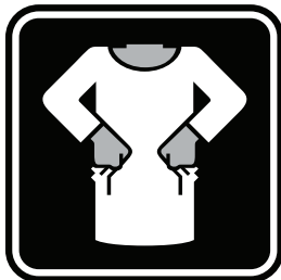
S4-04 Gowns INT