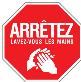
S1-05 Arrêtez Lavez-vous le Mains FR