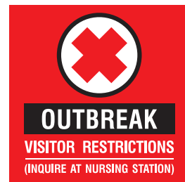
S3-03 Outbreak - Visitor Restrictions EN