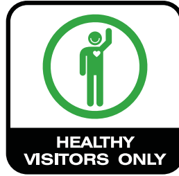
S5-02 Healthy Visitors Only

RGB PNG - 75px 250px 750px GRAY PNG - 75px 250px 750px RGB JPEG - 75px 250px 750px GRAY JPEG - 75px 250px 750px EPS - CMYK GRAY