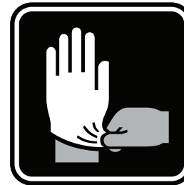
S4-03 Gloves INT