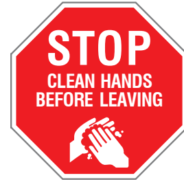
S1-03 Stop: Clean Hands Before Leaving EN