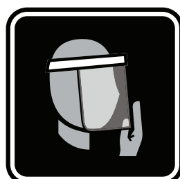
S4-05 Face Shields INT