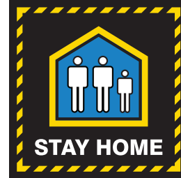
S5-06 Stay Home EN