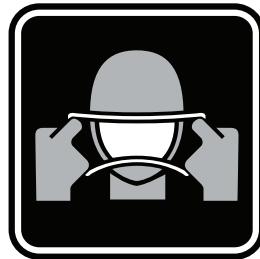
S4-02 Masks INT