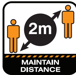
S5-05 Maintain Distance EN