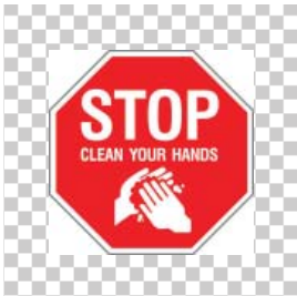
RGB JPEG (no transparency leads to white square around the image)