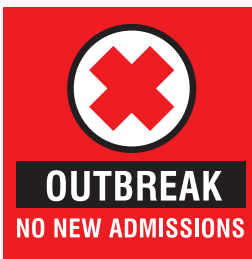
S3-02 Outbreak - No New Admissions EN