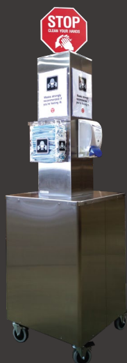
MSFC-ER-16 Extended Column, no drawers

Important: Automatic dispensers vary significantly in terms of sensor sensitivity and may inadvertently activate on their own. Manual dispensers are strongly recommended on our stations (sold separately).