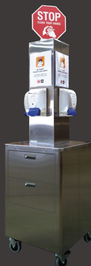
MIU-ER-2-16 Extended Column, 2-drawer