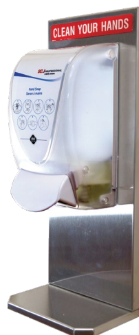
SSWC-16 Compact Wall