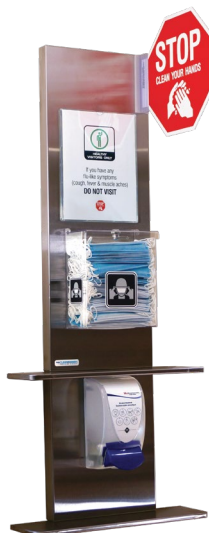
SSW-16-A Two-Shelf Wall

Durable and readable, designed with an innovative bracket system to prevent wall damage.