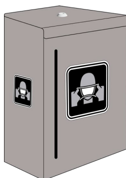
Tagg Clean-Hands® Mask Dispenser (illustration shown) Surgical-grade stainless steel, made in Ontario, Canada DSP-M-24

Our all-new Tagg Clean-Hands® mask dispenser design features: