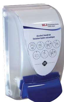
SCJ Professional/Deb Microsan® Optidose™ Dispenser DEBFS1LDS