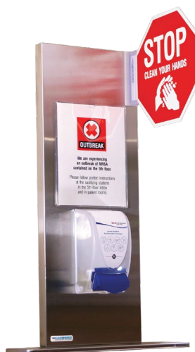
SSW-16-C One-Shelf Wall