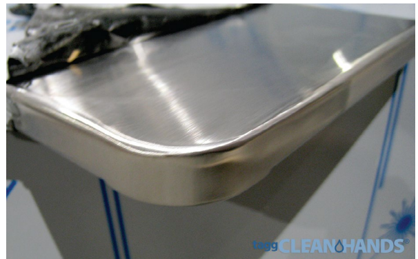
Shelf corner finish detail

Together with our Wall Stations, Floor Stations, Symbols, Signage and Templates, you have a complete and reliable hand sanitizing solution!