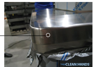
Table top corner finish detail

Together with our Wall Stations, Floor Stations, Symbols, Signage and Templates, you have a complete and reliable hand sanitizing solution!